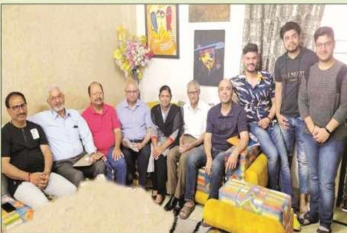
MS Ashok Vihar Monthly Meeting on 2 June 2019