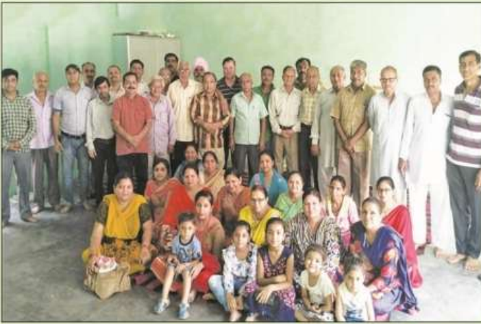
MS Jagadhari Workshop Monthly meeting on 2 June 2019