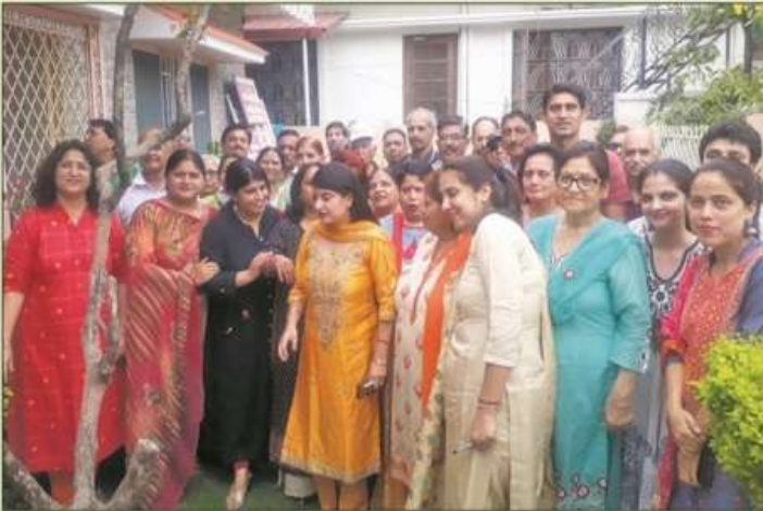
MS Dehradun Monthly Meeting on 16 June 2019