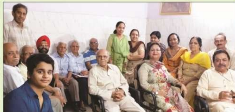
MS Paschim Vihar Monthly Meeting on 26 May 2019