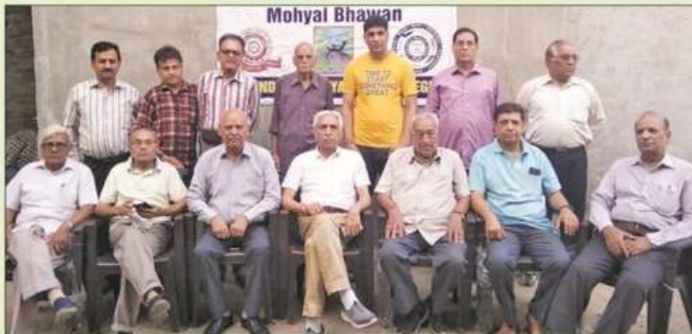
MS Jalandhar Monthly Meeting on 19 May 2019