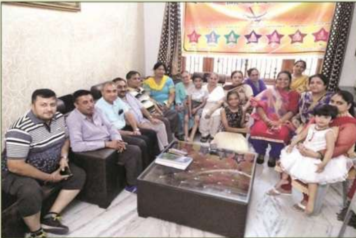
MS Paonta Sahib Monthly Meeting on 19 May 2019