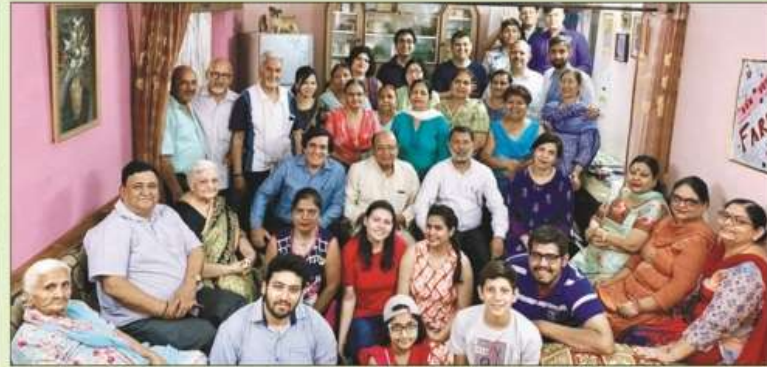
MS West Zone Monthly Meeting on 2 June 2019