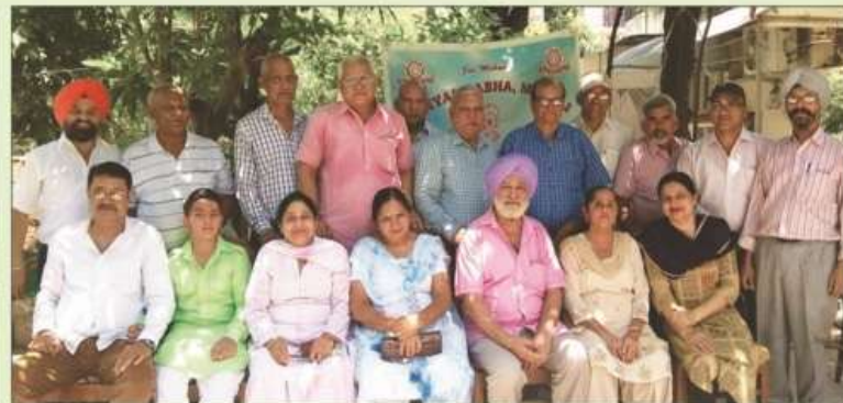
MS Mohali Monthly Meeting on 9 June 2019