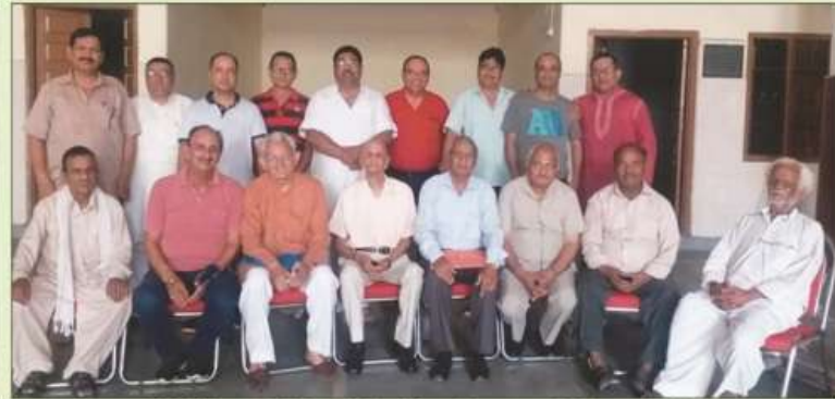
MS Karnal Monthly Meeting on 2 June 2019