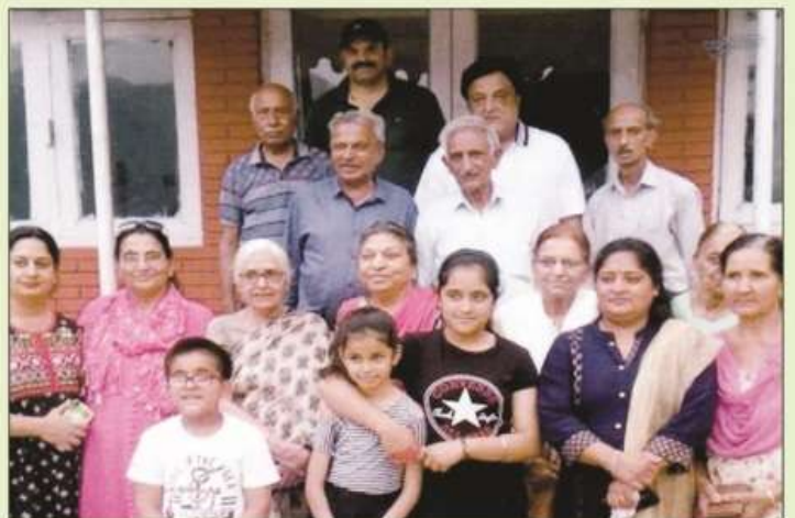
MS Solan Monthly Meeting on 2 June 2019