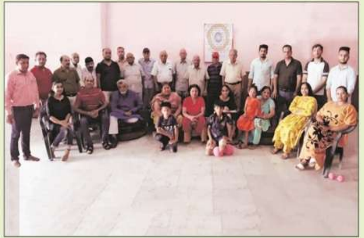
MS Ambala City Monthly Meeting on 2 June 2019