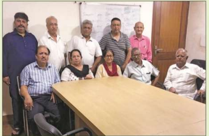
MS Mehrauli Monthly Meeting on 2 June 2019