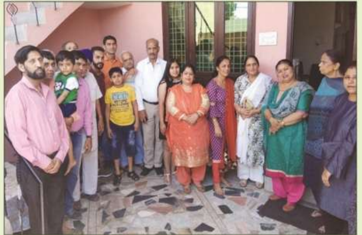
MS Premnagar Dehradun Monthly Meeting on 26 May 2019