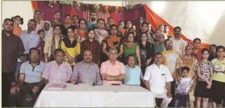
MS Amritsar Monthly Meeting on 2 June 2019