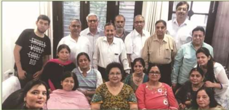
MS Ghaziabad Monthly Meeting on 26 May 2019