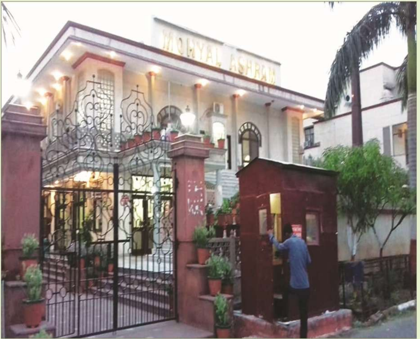
Mohyal Ashram Haridwar at Night