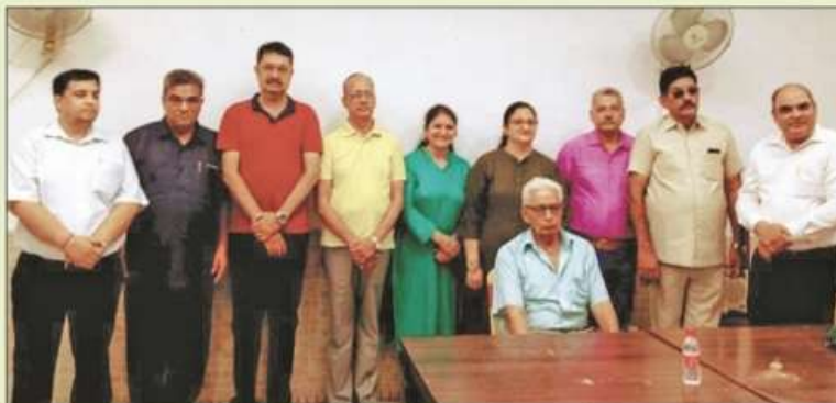
MS Panchkula Monthly Meeting on 2 June 2019